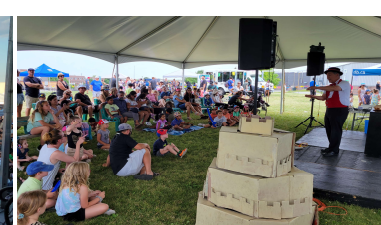
Kidsfest at 2022 Rotary Ribfest