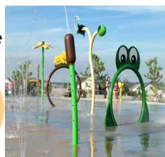
Fendley Park Splash Pad