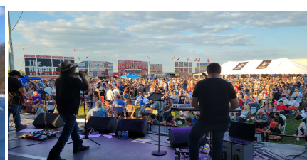
2022 Rotary Ribfest