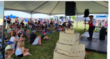
Kidsfest @ Rotary Ribfest