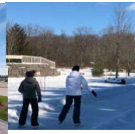
Skating Trail at Island Lake Natural Playground