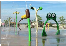
Fendley Park Splashpad