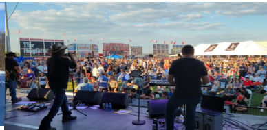
Big Stage @ Rotary