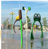
Fendley Park Splash Pad