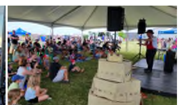
Kidsfest at Rotary Ribfest