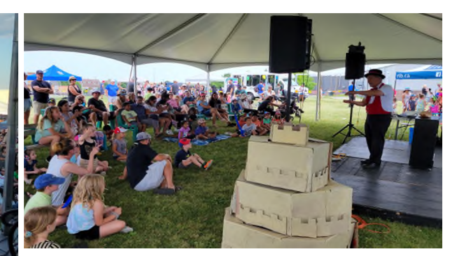
Kidsfest at Rotary Ribfest