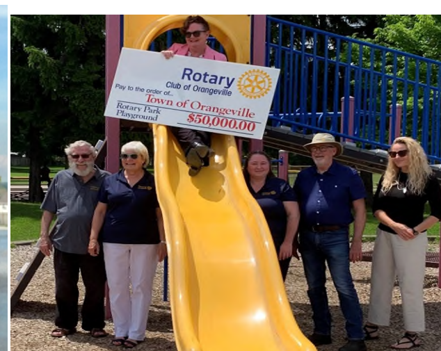
New Children Playground at Rotary Park