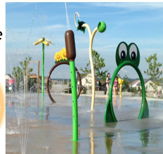
Fendley Park Splash Pad